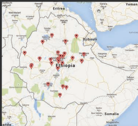
ETHIOPIAN CHURCH PLANTING TRAINING CENTERS