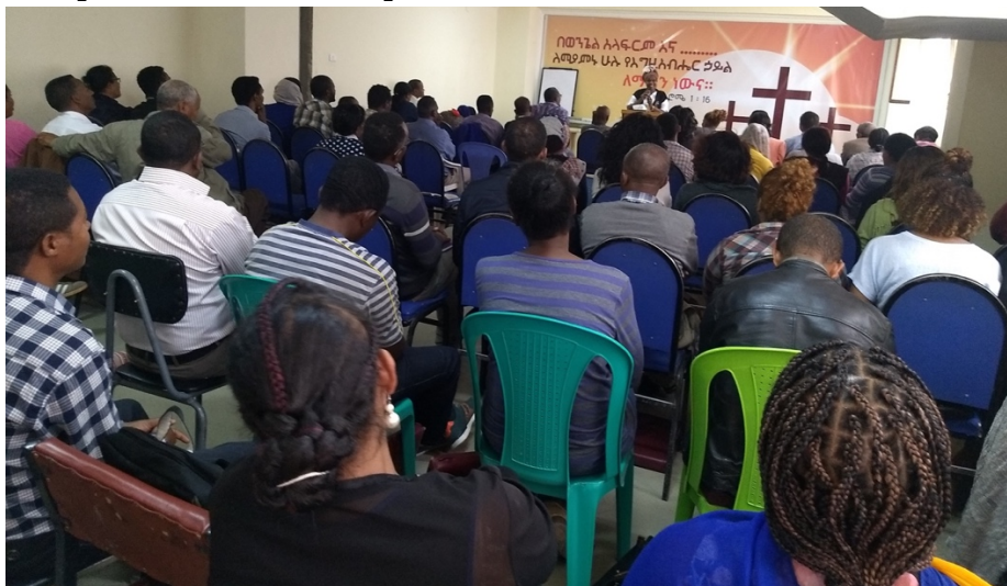
Picture: Head office three days fasting and prayer meetings.

5. Prayer Movement: Prayer is the backbone of all mission activities of the ministry and the key tool to fulfill the Great Commission. It is a special focus of GCME that staffs give due attention to prayer and fasting; and each ministry strategy is encouraged to have its own prayer-oriented movements. We implemented devotion time with staffs weekly, monthly prayer and fast times, a quarterly program of three-day prayer and fast times that involved every staff member were implemented twice. The focus of our prayer is our nation and the expansion of the Gospel.