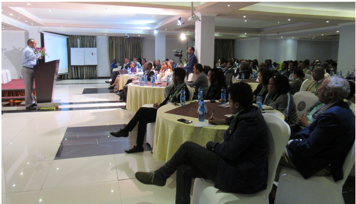
Picture: Ignite Ethiopia L.I.F.E. Partners Conference – Addis Ababa.

The theme of the conferences was “Ignite the gift that is in you”. Topics covered during the conference were Stewardship, L.I.F.E. (Leadership, Influence, Finance, and Expertise), Profession as a call, The Great Commission, Importance of reaching leaders and Strategies of reaching leaders.