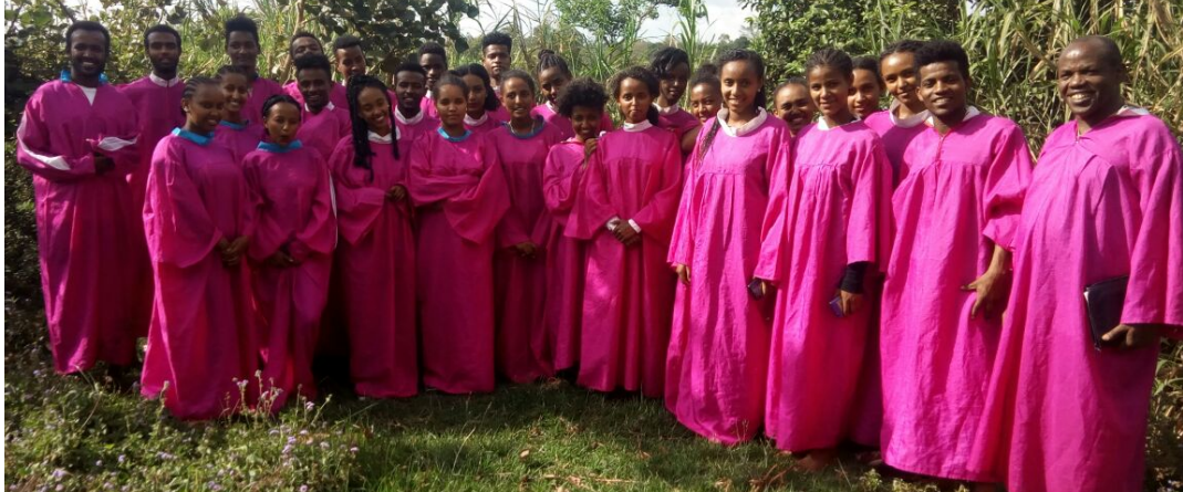
Picture: Water baptism for converted students