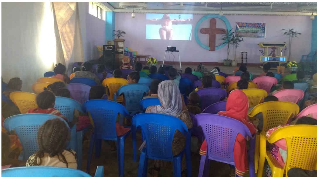
Picture: People watching the Jesus Film and welcoming Jesus to their lives as response to the film, respectively.

In addition to the Ale and Gumuz film shows, there were another 84 Jesus Film showing with 65,241 viewers out of which 3,322 decided to follow Jesus Christ and 1,289 are being followed up.