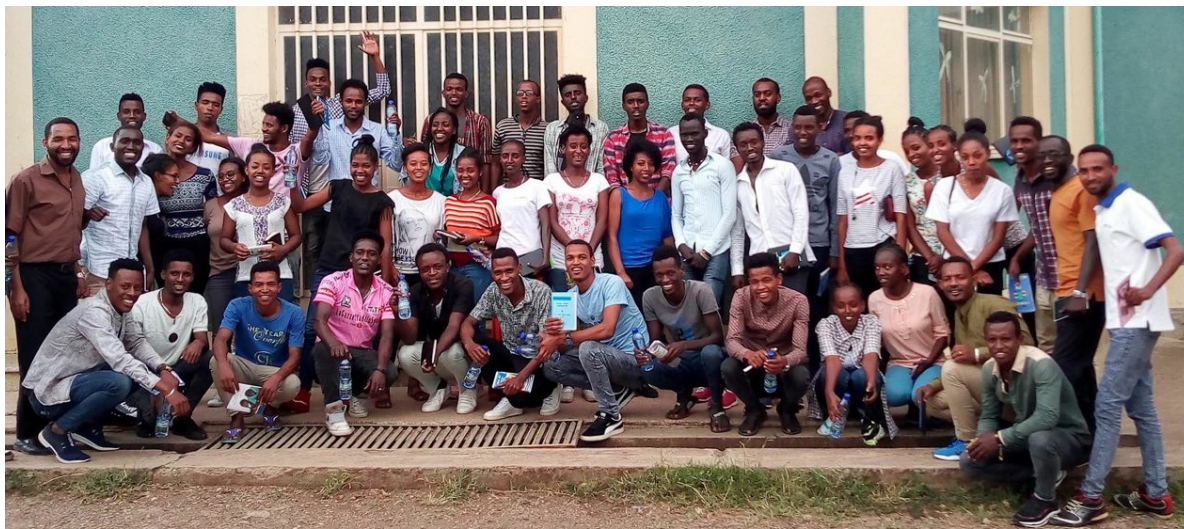
Picture: Leadership training for students