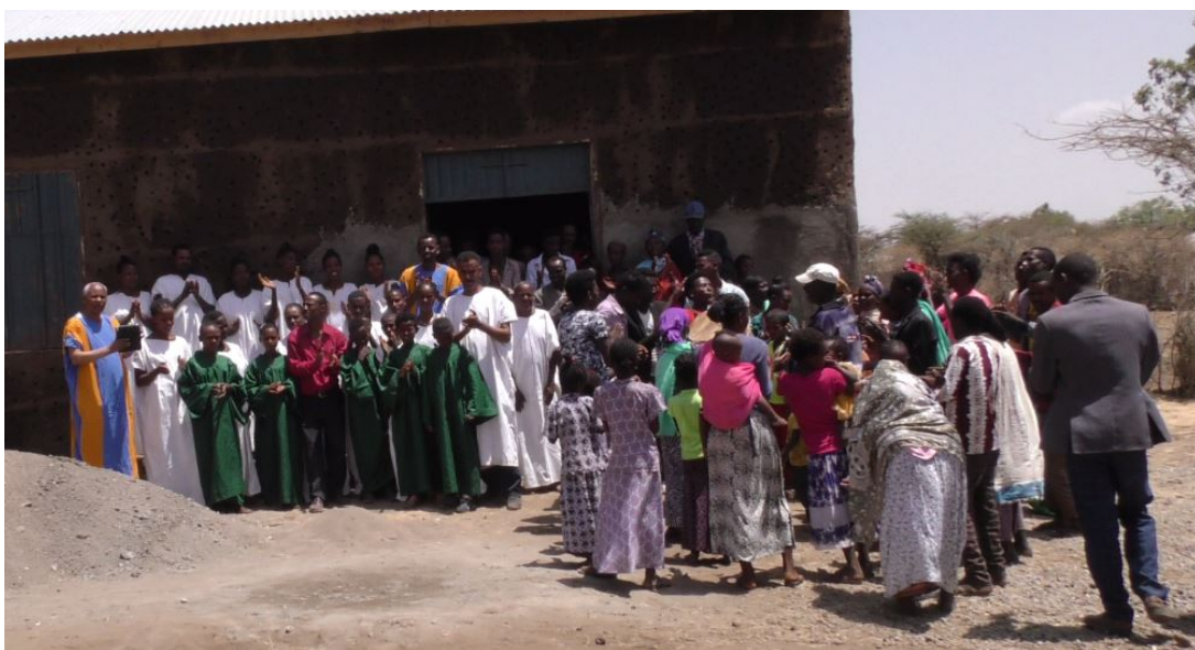
Picture: Water baptism at one of our mission site, East Shewa