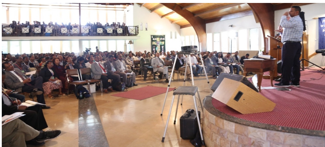
Picture: Annual church leaders conference

In the Annual church leaders program, which is called “Evangelical Leadership Summit”, that has happened for the third time in February, 2019, about 550 church leaders attended the three days training under the theme of “current challenges and responsive church leadership”