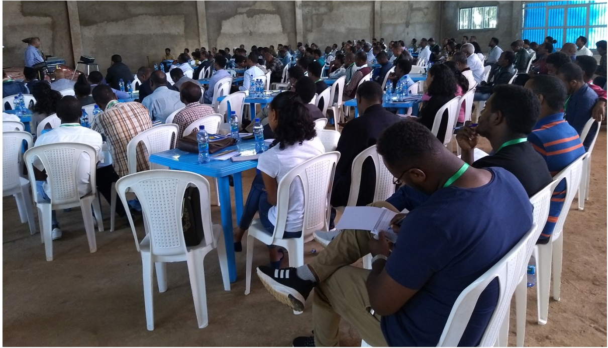
Picture: Ignite Ethiopia L.I.F.E. Partners Conference – Jimma, Ethiopia.

The theme of the conferences was “Ignite the gift that is in you”. Topics covered during the conference were Stewardship, L.I.F.E. (Leadership, Influence, Finance, and Expertise), Profession as a call, The Great Commission, Importance of reaching leaders and Strategies of reaching leaders.