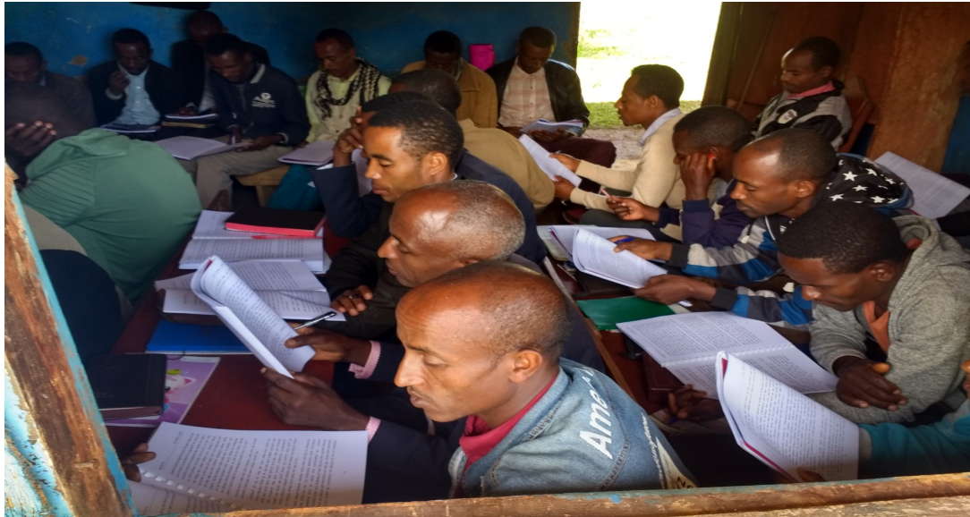
Picture: PTP training meeting

6.1. Pastoral Training Program (PTP): 867 pastors that are going through a yearlong biblical training took the second phase training and through them 11,134 other ministers including elders are trained; more than 60,485 people heard the Gospel, 8308 decided to follow Christ and 81 new churches are planted. In addition, 17,366 believers are actively participating in regular prayer groups. In Romans Project, 876 pastors and church leaders took the challenge to read the Book of Romans 20 times and rewriting it in hand.