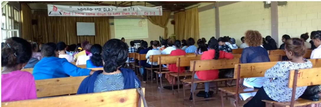
Picture: Vision sharing for women

1.3. Women for Change: Women's ministry is part of the global church movement and its mission is launching movement by mobilizing women that account for half of the Christian community. Women have a great impact in bringing transformation within the society. Therefore, GCME strives in assisting women to pray in accordance to the Scriptures in their local churches and mobilize them to multiply themselves from home, neighborhoods and the community.