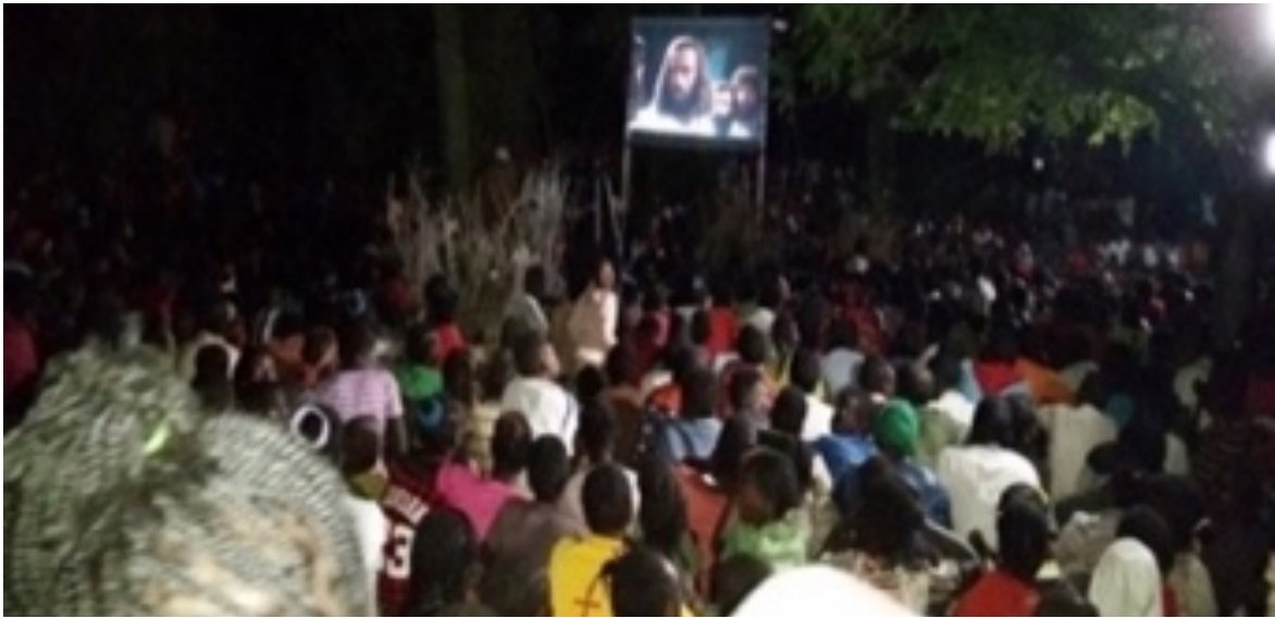
Picture above: Ale Jesus Film outdoor showing: two film shows have been conducted and about 9000 people watched it, and as a result about 60 of them came to Christ.

In addition to the Ale and Gumuz film shows, there were another 84 Jesus Film showing with 65,241 viewers out of which 3,322 decided to follow Jesus Christ and 1,289 are being followed up.