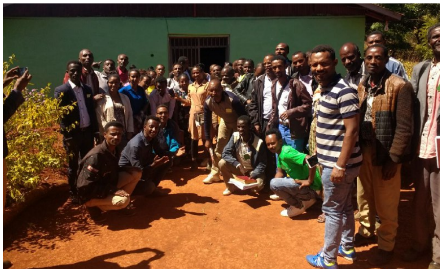
Picture: Sunday school teachers at AWANA training