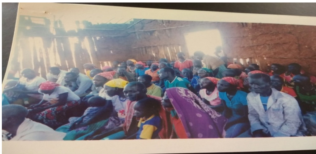
Picture: Dalecha church